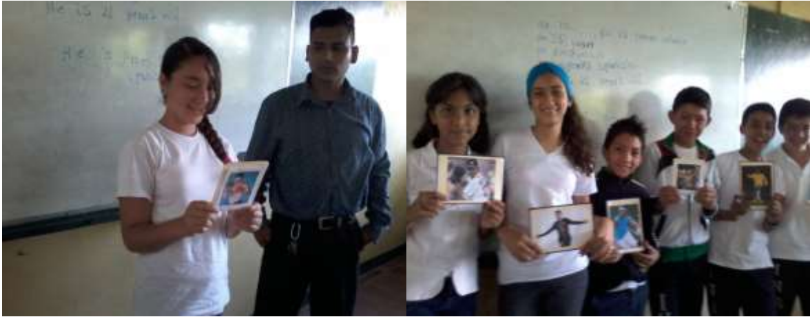
They firstly created a picture card, after that, describe it.