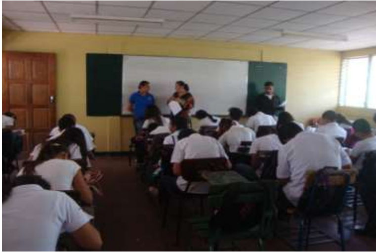
Students of eight grade A and their English teacher filling a survey.