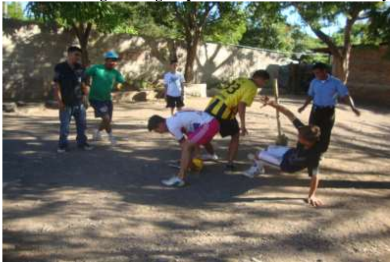
Students playing a football match in the English Class.