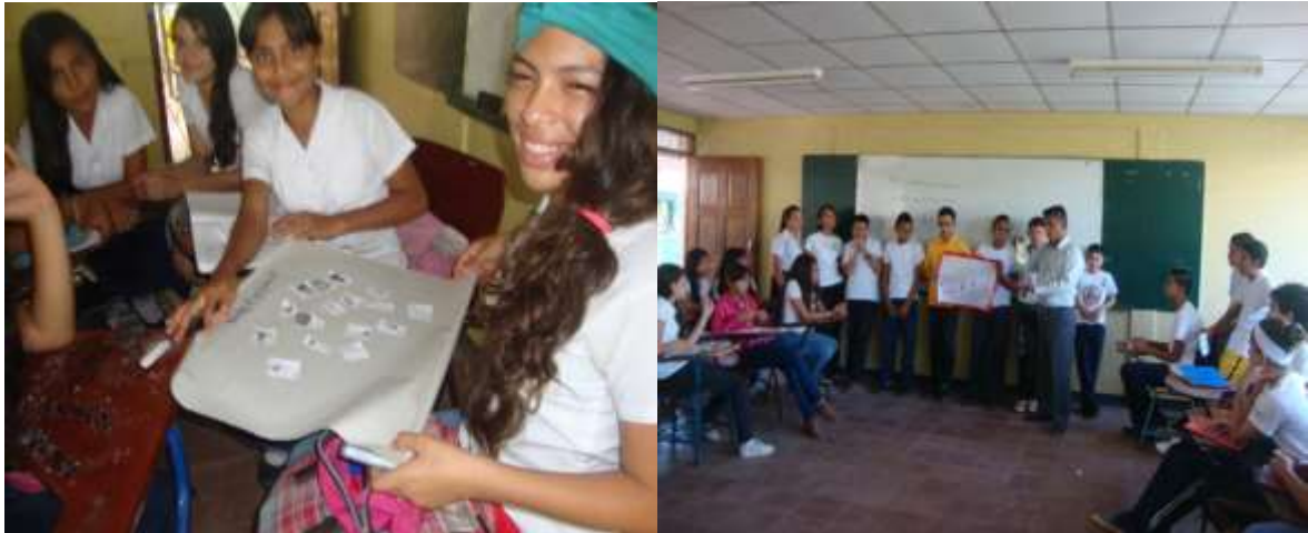
In the left picture, they elaborate a wall paper with sport equipment, in the right, one of the researchers hand in a gift to a group who did the best work orally and written.