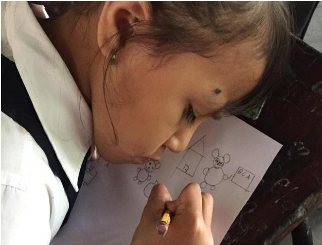
Student drew her own story.