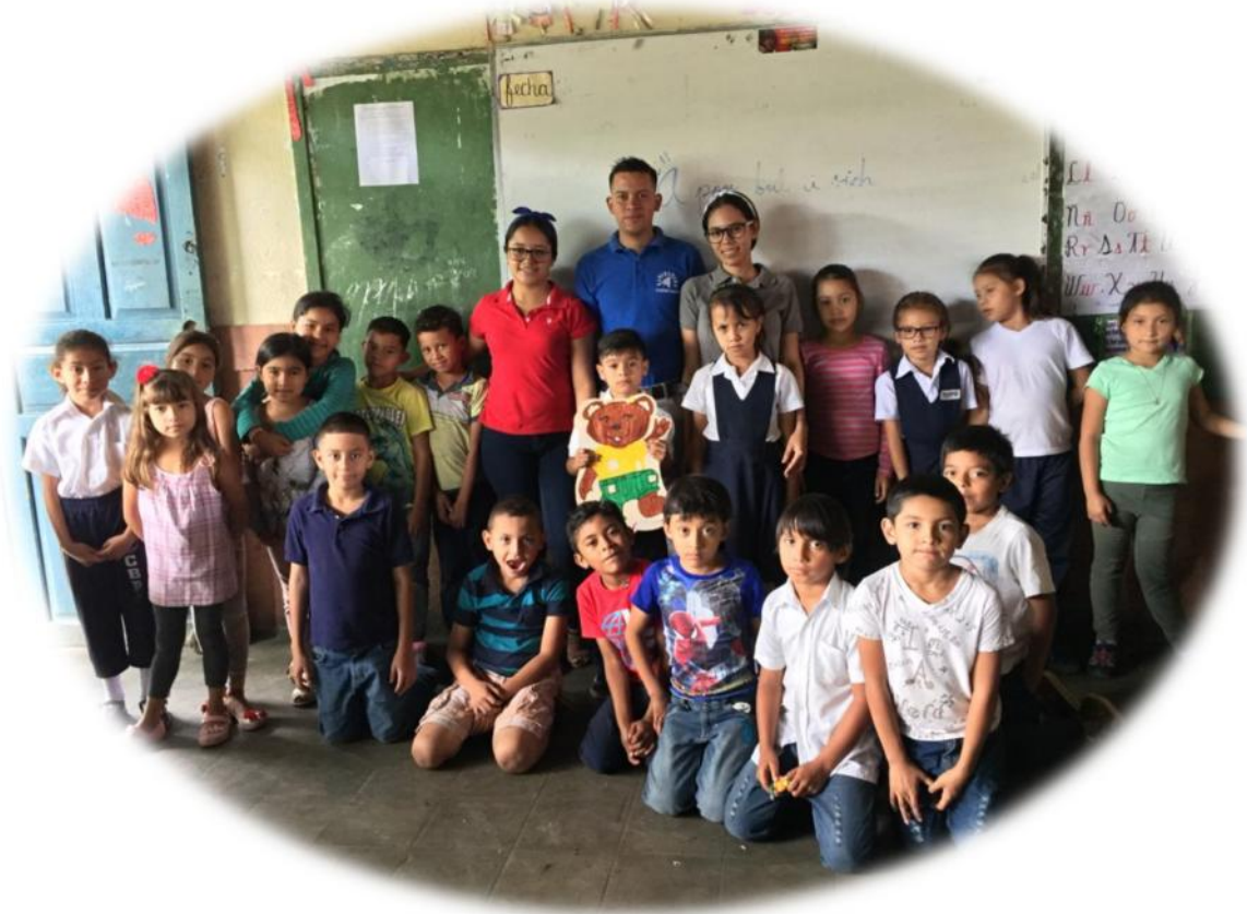
Boys and girls of second grade B with the teacher and their own story “ A poor but a very rich Teddy bear”