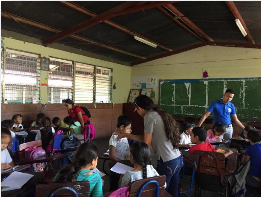
Teachers giving clear instruction.