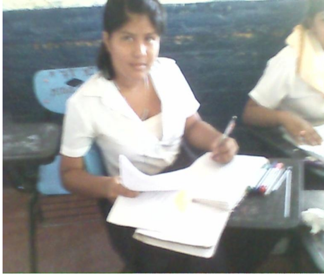
Student copy of the blackboard her Homework.