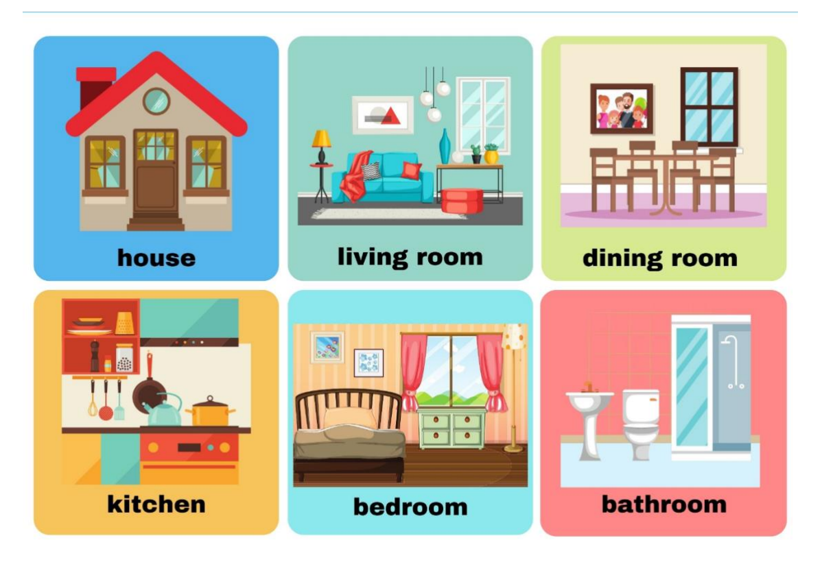
2. The teacher will repeat the vocabulary and practice pronunciation with the students.

1. Teacher should teach the vocabulary (at least 5 new words) using eye-catching flashcards for the children