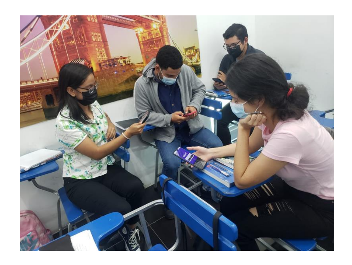
Figure 1. Students downloading and registering in the kahoot app.