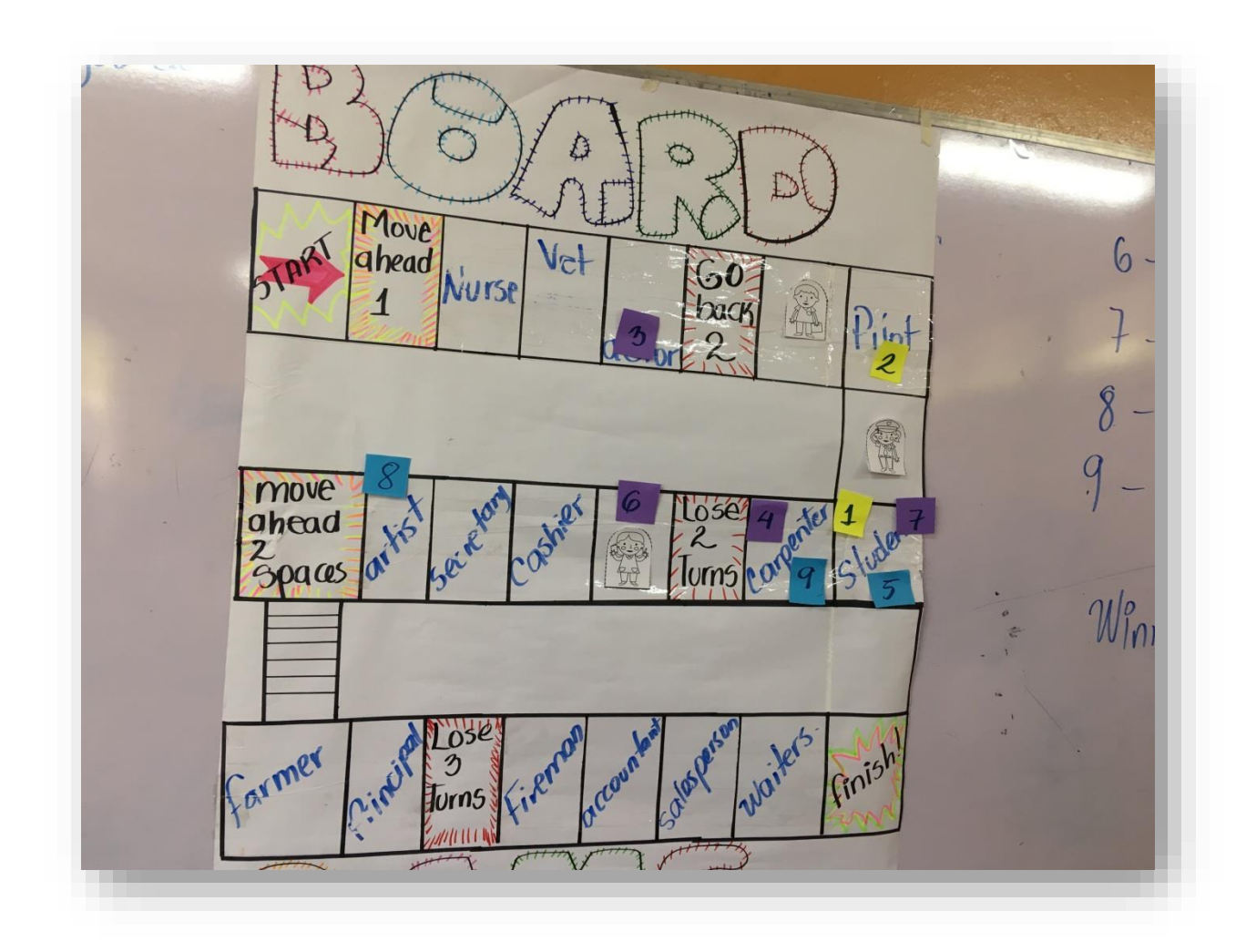
Photograph 2: Playing board game in 9 th grade A in general.